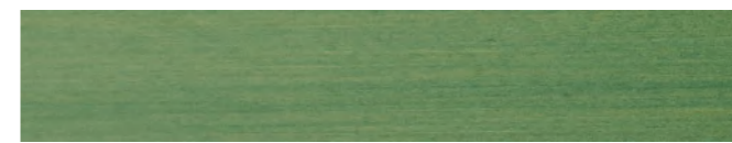
210-418 *avocado ■ avocado ■ avocat aguacate ■ avocado ■ avokado