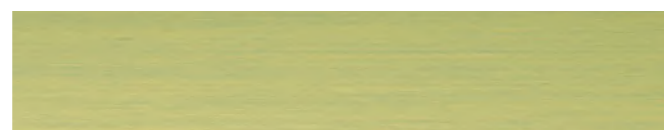
210-116 linde ■ lime ■ tilleul tilo ■ tiglio ■ linde