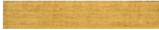
210-076 eiche ■ oak ■ chêne roble ■ quercia ■ eik