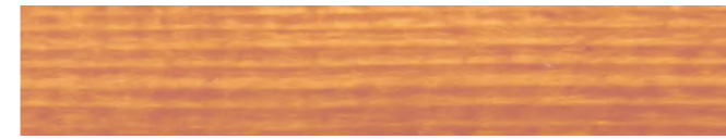
210-273 honigton-rötlich ■ dark honey ■ miel roux miel rojiza ■ rosso miele ■ rød honning