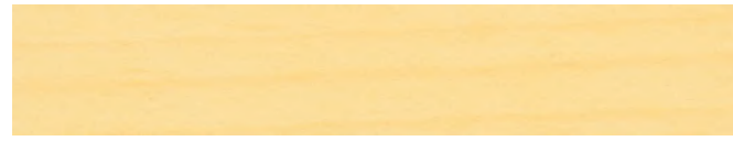
210-203 *hell ■ light ■ clair claro ■ chiaro ■ lys