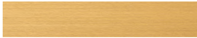
210-032 pinie ■ pine ■ pin parasol pin pinonero ■ pino ■ pinje