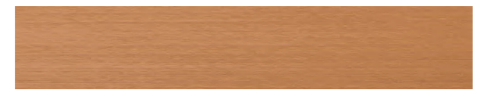
210-042 teak dunkel ■ dark teak ■ teck foncé teca oscura ■ teak scuro ■ mørk teak