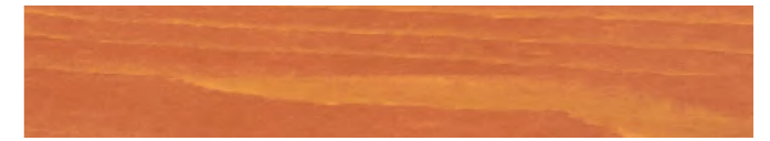
210-056 sanddorn ■ sea buckethorn ■ argousier rojo gayuba ■ olivello spinoso ■ tindvedrod